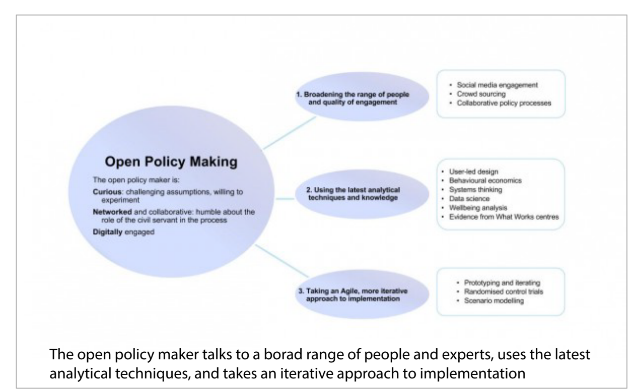
Figure 2. Open Policy Making (https://openpolicy.blog.gov.uk/what-is-open-policy-making)

Table 1 summarises the ways in which its advocates identify the distinctive characteristics of Open Policy Making: